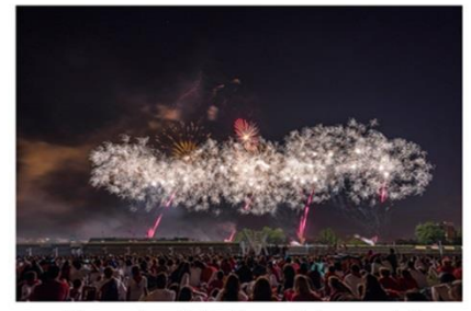
"Generaciones bajo el fuego de luces y color" Carlos Mauricio Bernal 3º premio 2015